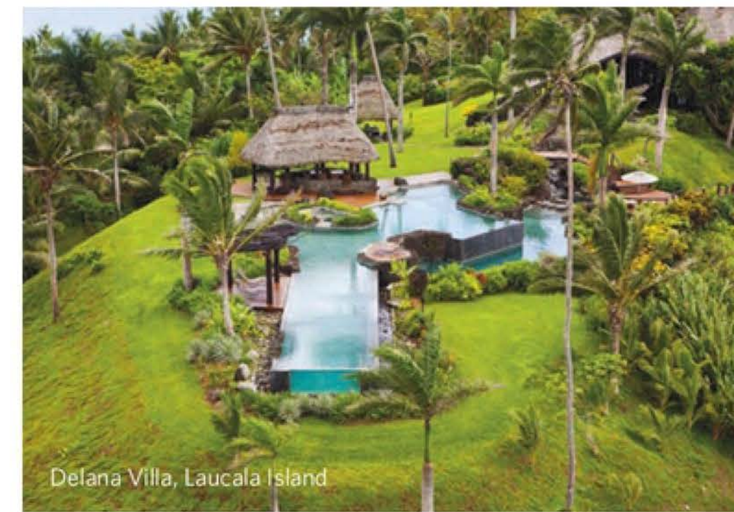
Delana Villa, Laucala Island