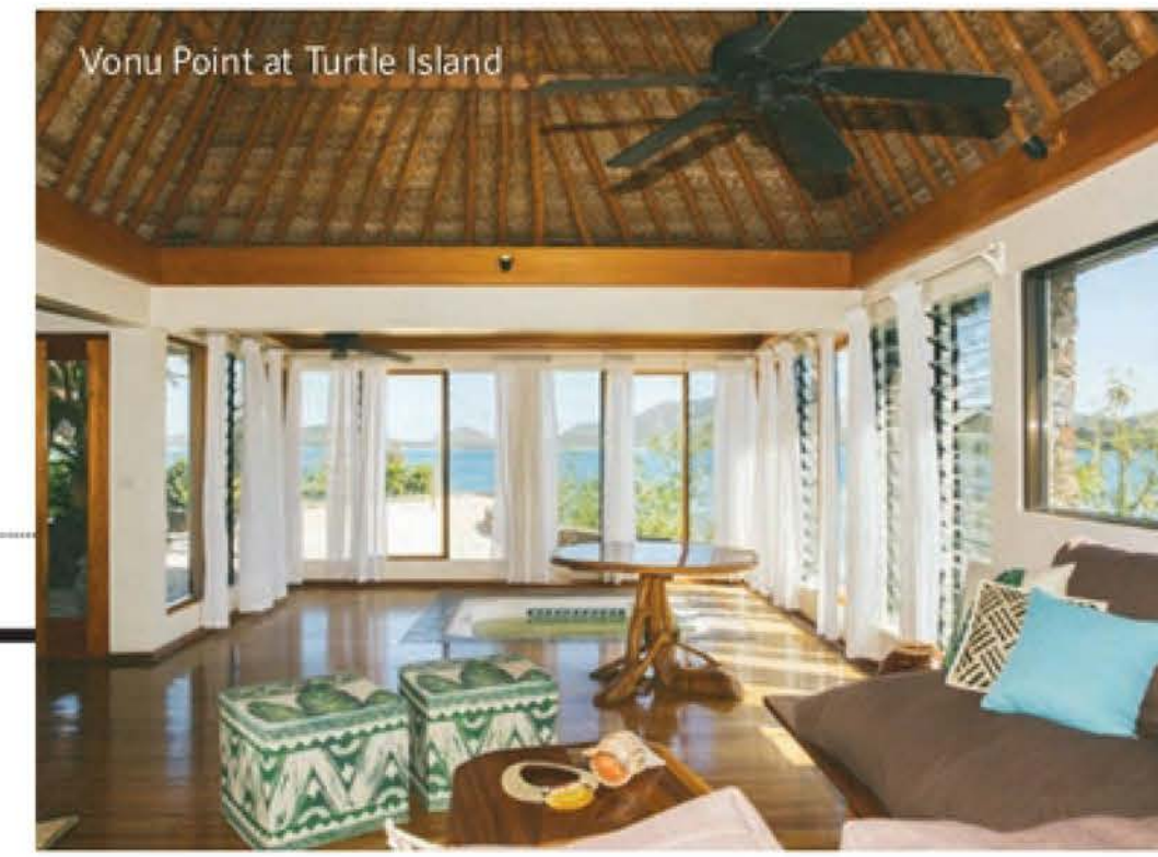
Vonu Point at Turtle Island