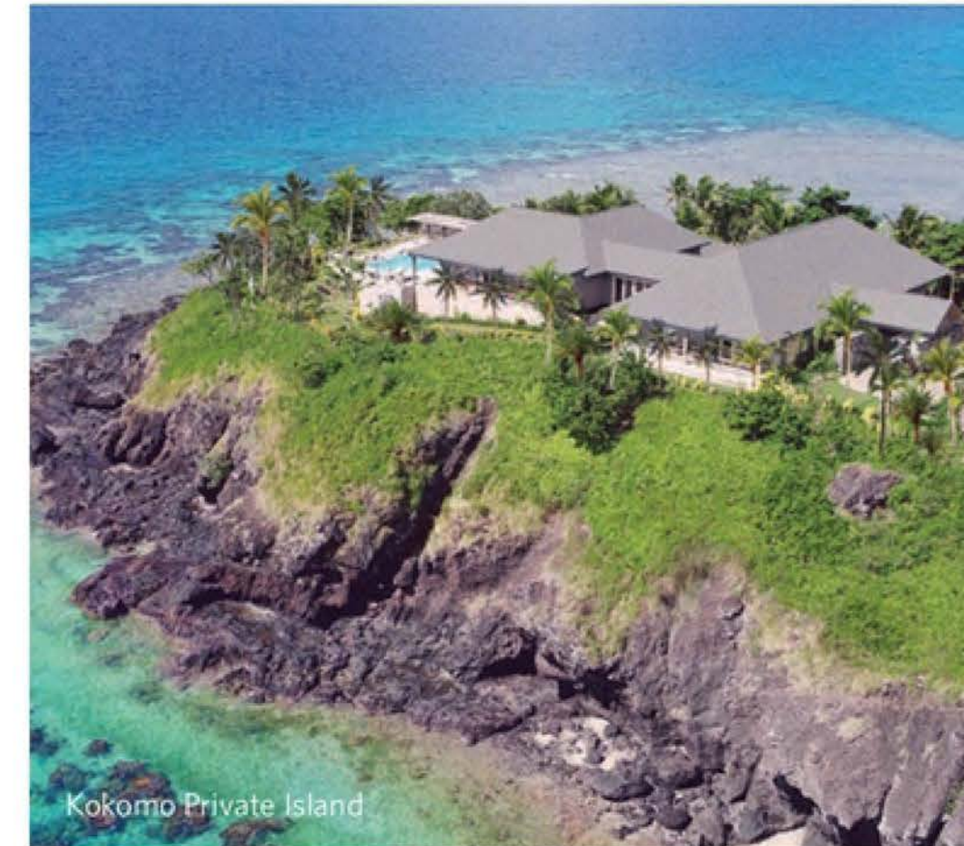
Kokomo Private Island